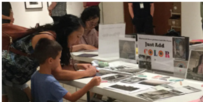
Sheldon Family Day, July 16

Morris's 1946 book, The Inhabitants , pioneered the "photo-text" literary genre. In a photo-text, words and photographs are combined to create the narrative of the book. The Home Place , Morris's 1948 book of the same style, was published to popular and critical acclaim, and is celebrated again this year as part of the Nebraska 150 Books reading list. These books inspired our collaborative effort with the Sheldon Art Museum to celebrate Wright Morris for the Nebraska Sesquicentennial, which culminated in a Nebraska Birthday Party at the 2017 Sheldon Family Day.