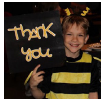
Brady the Bee