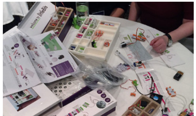
Build Your Own Robot toys available in LCL Makers Spaces