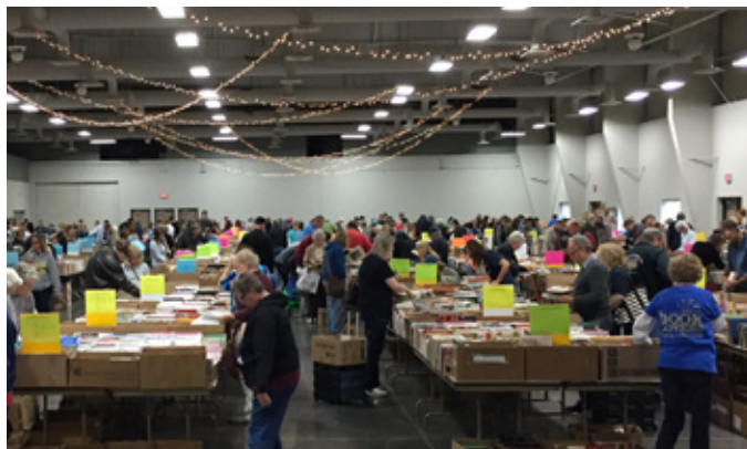
Crowds flow in for the Annual Book Sale