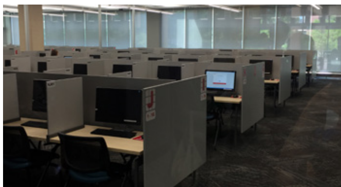
UNL Testing Center

If you attended UNL in the dark ages, as some of us did, you will remember the stacks that remain in some areas, but you will wish that you could return to college and enjoy this new space that encourages collaborative learning, provides new technology for equal access for all students, includes a testing center making it easier for students to take tests according to their schedules, and so much more. You really have to see it to believe it!