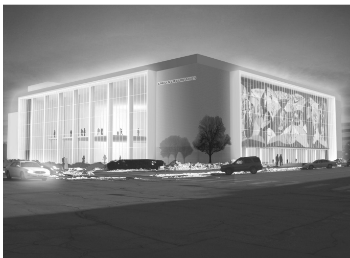
Artistic Rendering of a new central library on the p.s.

A city that values education as Lincoln does deserves a strong library system with a new 21st Century Central Library at its core. The Lincoln City Library Board and the Foundation for Lincoln City Libraries want to build a new 21st Century Central Library to meet the needs of our growing community for the next 50 years.