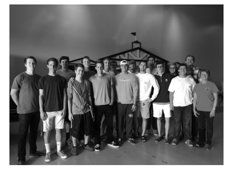
Sigma chi volunteers at book sale