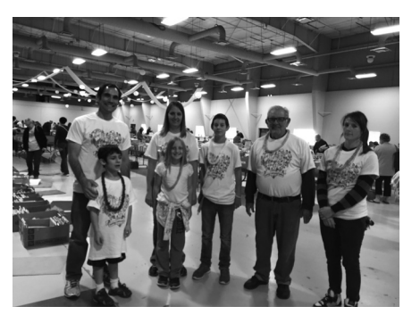
B & R volunteers book sale