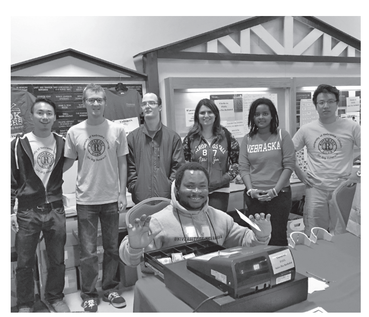
UNL's student Rotary Group, Rotaract, spent their afternoon helping at the 2015 Book Sale.