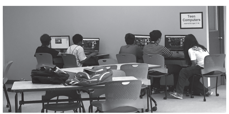
Teens at BMPL enjoying their new computers in their new space!