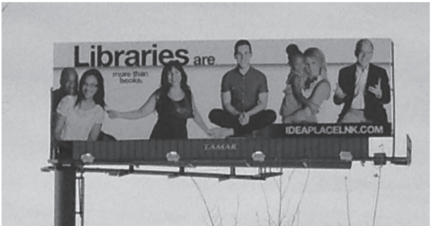
See billboard on 600 West Van Dorn

Visit IdeaPlaceLNK.com to see what your friends and neighbors are saying about Libraries!